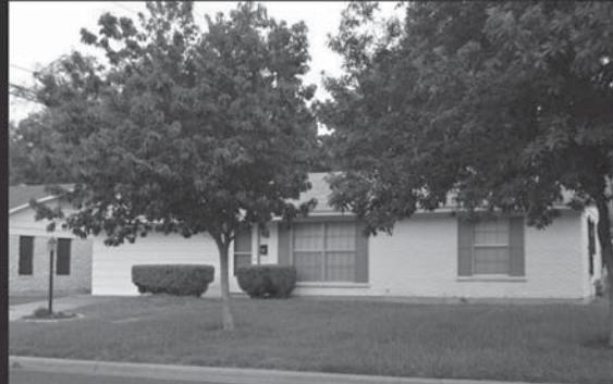
DECORATING OUR YARDS WITH THE AMERICAN FLAG FOR 23 YEARS

My listing at 8205 Rockwood received multiple offers and sold in one week. If you are contemplating selling this year, call me and I will assist you in getting the highest price possible for your home. I have been in the business longer than any of my competitors that market our area and have sold over 66 homes in our area!